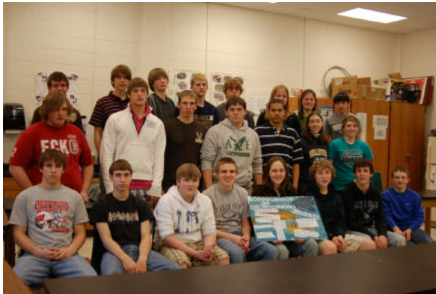
Kiel High School, Introduction to Aquaculture Class