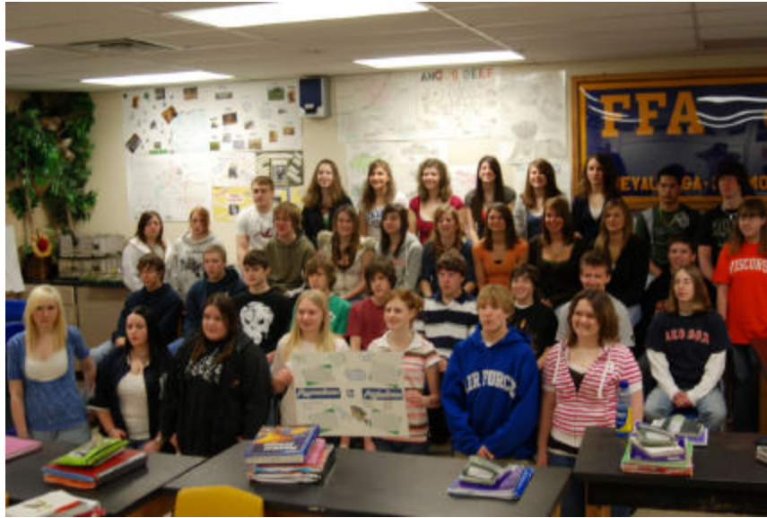
Weyauwega- Fremont High School, Introduction to Science Class