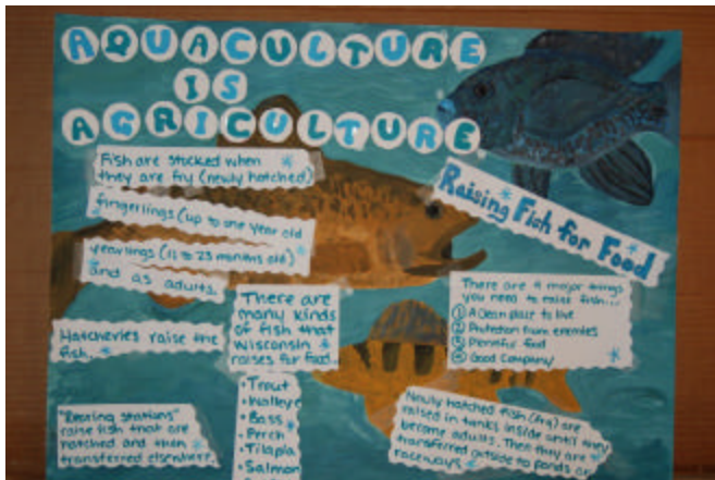
First Place Winner - Kiel High School