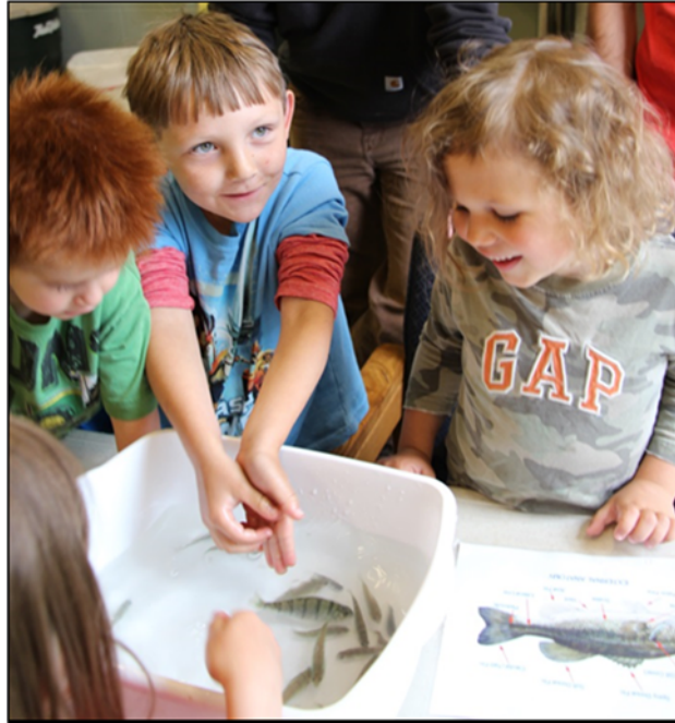
Interactive tours at UWSP-NADF. Photo showing kids from Red Cliff's Headstart Program.

So far this year, over 300 people have traveled for a tour of the UWSP-NADF. Tours range from one to three hours and may consist