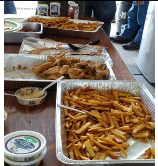
Smoked Trout Spread, French Fries, Fried Catfish and Fried Salmon