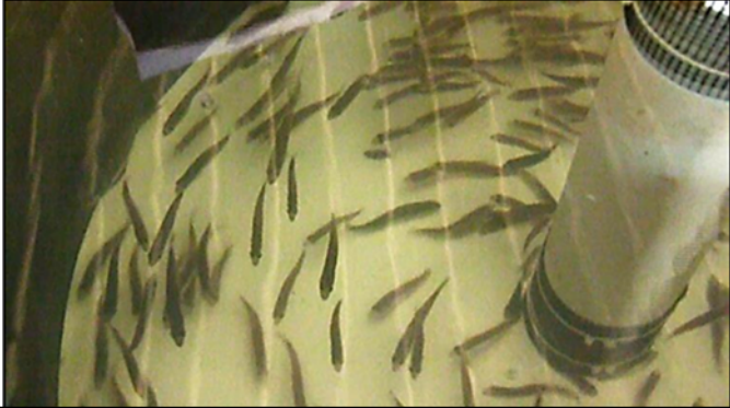
Intensively raised, feed trained walleye fingerlings reared at UWSP-NADF were transferred to Northside Enterprises as part of the partnership.

In addition to yellow perch, intensively reared and feed trained walleyes were transferred from UWSP-NADF to Northside Enterprises in Black Creek for extended fingerling grow-out in indoor systems. This project was part of the Wisconsin Walleye Initiative as well as a USDA Small Business Innovative Research (SBIR) grant (Phase II).