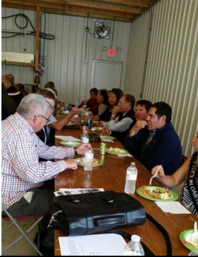
Attendees enjoying a great meal of fresh fish!